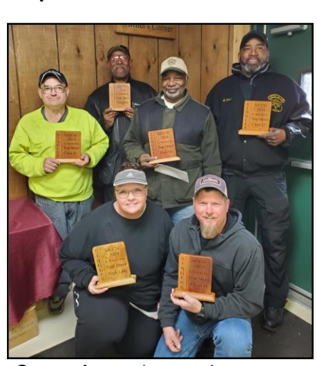
Group of some happy winners